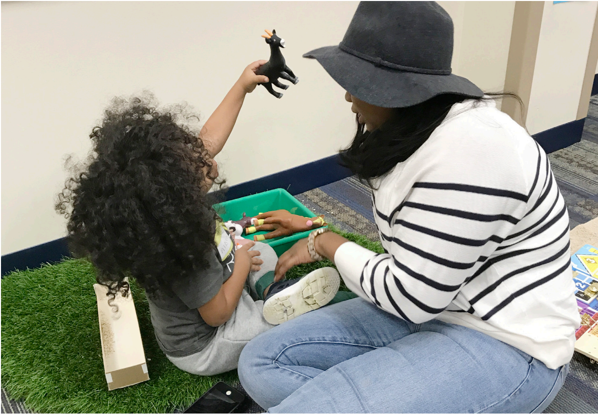
A family explores pretend play activities together at Teach Me to Play in Westlake.